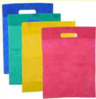
Non- woven Bags.